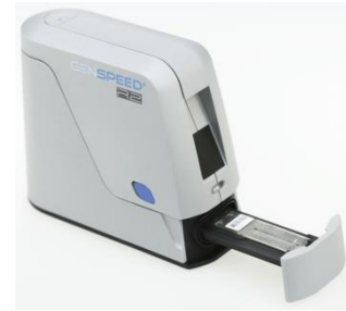
POC analyzer platform 'Genspeed'

Please find all the technical data in our "First information" or on our Website www.bartels-mikrotechnik.de .