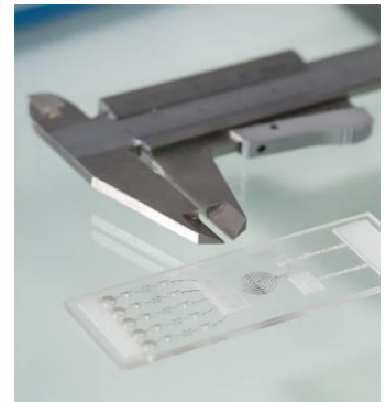
Physio Check – passive Lab-on-a-chip-system for diagnostics

With its small dimensions, the pump can be used as a subassembly integrated on chip, being a part of the disposable. Optimal space-saving can be achieved by placing parts of the pump directly into